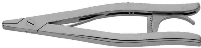
Screw Holding Forceps