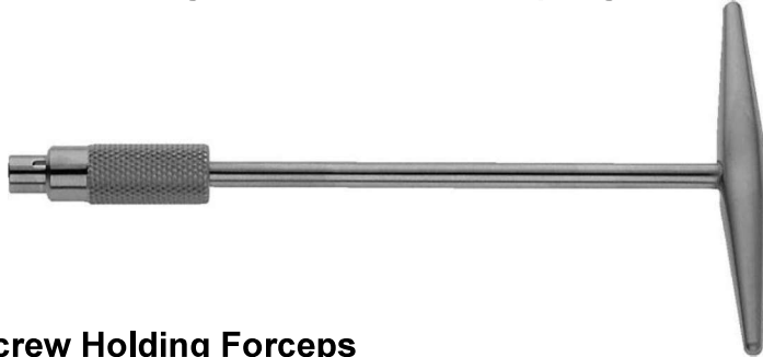
T-Handle Large with AO-Quickcoupling